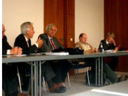
ISES-Europe AGM: representatives from ISES Italy, Romania, Denmark and Poland