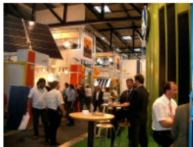
View of the exhibition of hall

Following EuroSun 2004 the UK-ISES delegates visited Intersolar 2004, Europe's largest trade fair for solar technology, which took place in Freiburg immediately after. The exhibition was most impressive, with 286 exhibitions. Regrettably, there were very few UK companies.